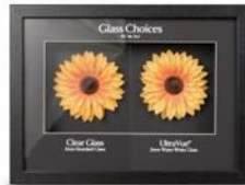
UltraVue Display M99-01053INT