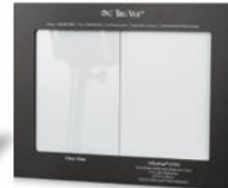
UltraVue UV70 Specifier M99-01282